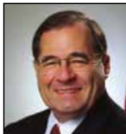
Congressman Jerrold Nadler