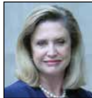
Congresswoman Carolyn Maloney