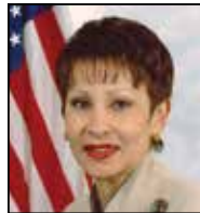
Congresswoman Nydia Velazquez